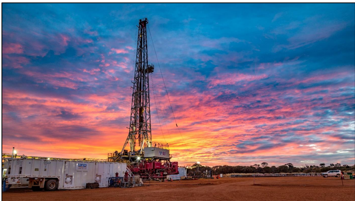
Figure 1: Ensign Rig 932

A rig contract with Ensign Drilling was executed in January for the 1,000 horse-power Ensign Rig 932, which is depth rated to 3,200 metres. It is significantly larger and more powerful than that utilised on the project previously and will both increase drilling rates for the Albany-2 and Albany-1/ST1 wells and reduce trip times when changing drill bits and other components on the bottom hole assembly.