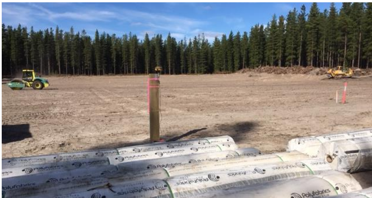
Figure 3: Nangwarry-1 lease preparations

Regulatory approval was received for building the drilling pad, with the pad construction now underway and expected to be completed by early May. Discussions are ongoing in relation to a drilling rig contract for Nangwarry-1.